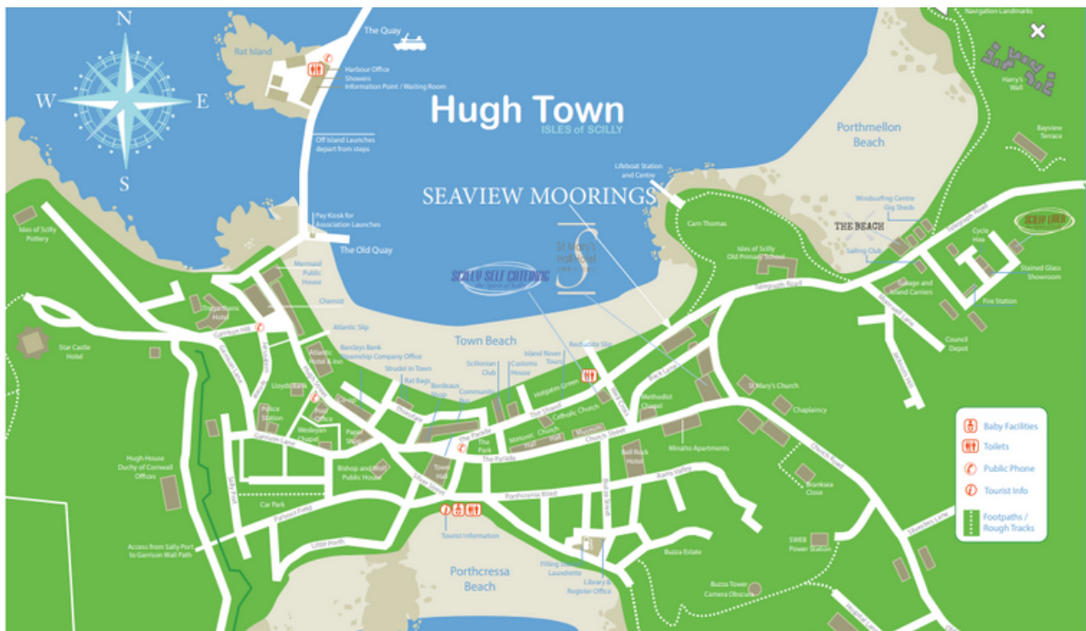
Map of St Marys